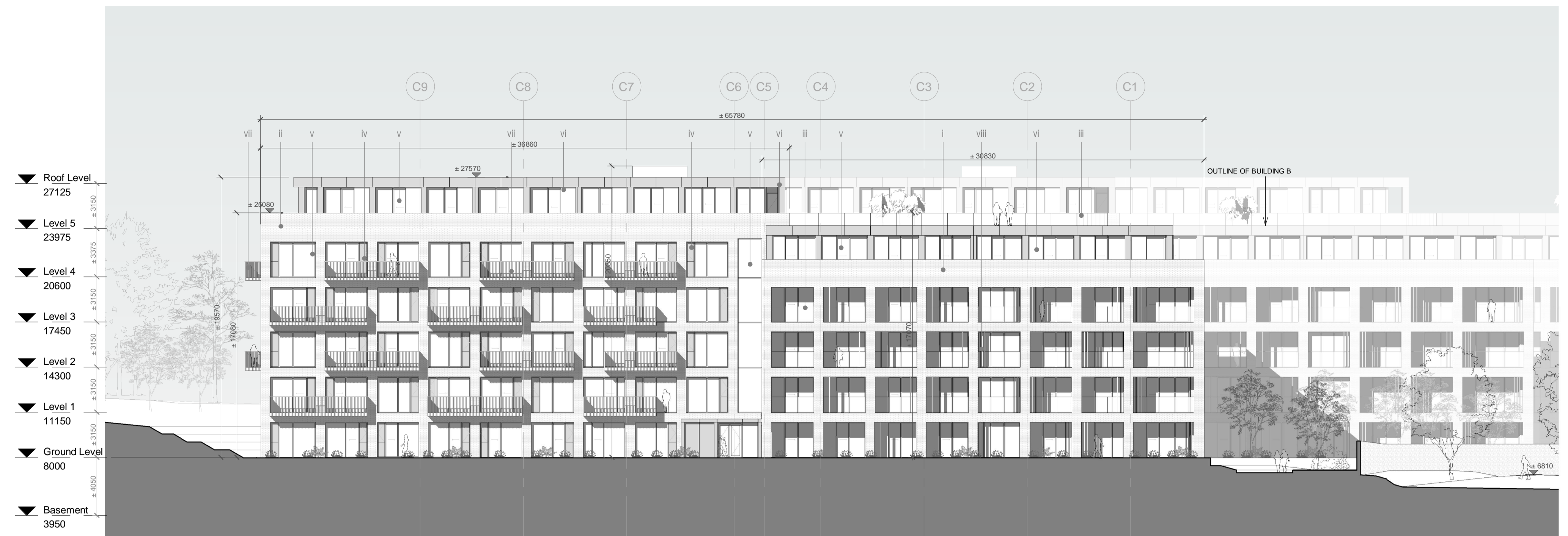
2 Building C - East Elevation scale 1 : 200