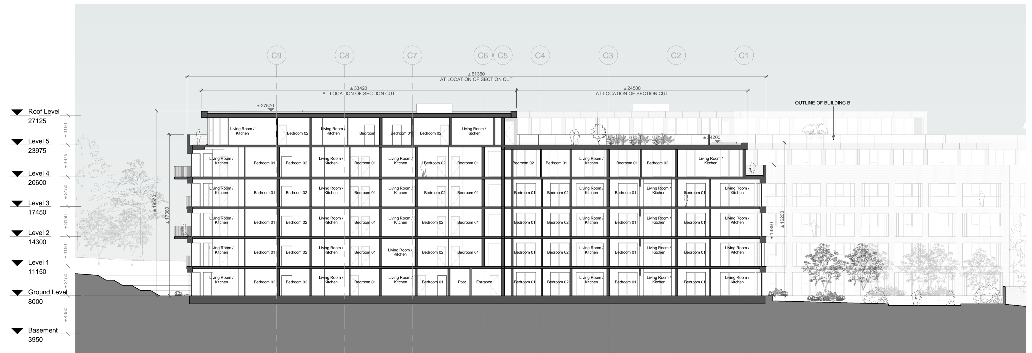
4 Building C - Section BB scale 1 : 200